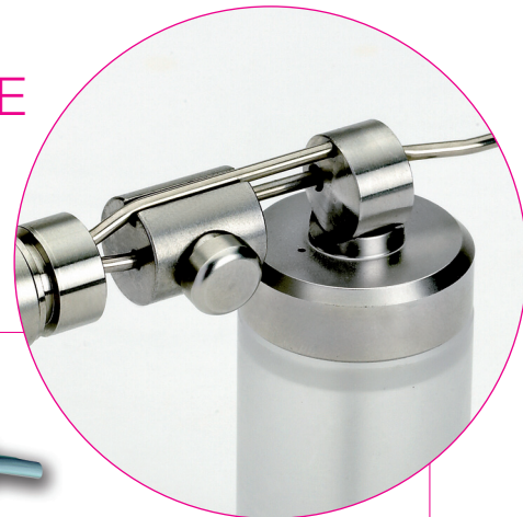
Quick Disconnect Coupling