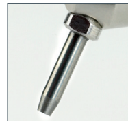
DENTO-PREP™ Spray Tip

DENTO-PREP™ is covered by a 1-year material and construction guarantee with the exception of the spray tip. The 3-digit number engraved at the rear reveals the time of production (Quarter and Year, i.e. "2010" = second quarter of year 10).