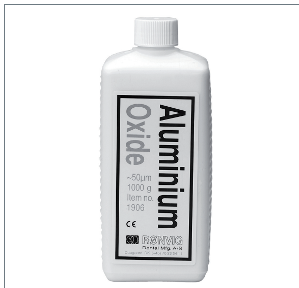
1 Kg Aluminium Oxide 50 µm. Item No. 1906

DUST-CABINET is covered by a 1 year material and construction guarantee.