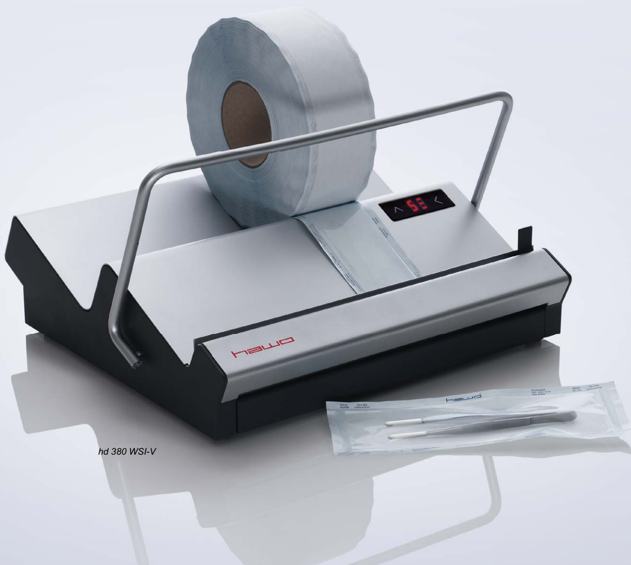
hd 380 WSI-V

The hd 380 WSI-V ValiPak is a validatable, permanently heated bar sealer for pouches and reels (SBS) in doctor's and dentist's surgeries. Thanks to the compact design it is ideal for use in small institutions. As the first sealing system in its class the ValiPak meets the validation requirements.