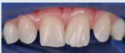
6. Modified rubber dam isolation. Note the highly reflective white enamel.