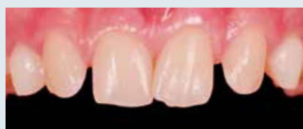
1. Note the presence of both deciduous upper canines and many dental diastemas due to the agenesis of the permanent counterparts.