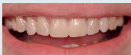
5. Intraoral mockup made with ExperTemp® temporary crown and bridge material.