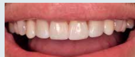
10. Integration between restoration and natural tooth structures resulting in a more harmonic smile.