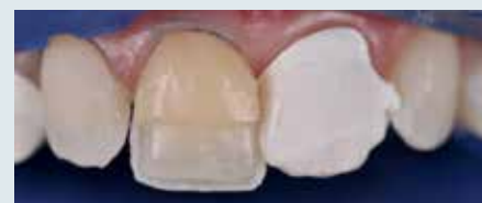
7. Layering of the palatal shell (Enamel White) and dentin (A3 on the cervical followed by A2 on the remaining buccal surface).