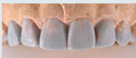
2. Final wax-up, following proper esthetic proportions and occlusion requirements.