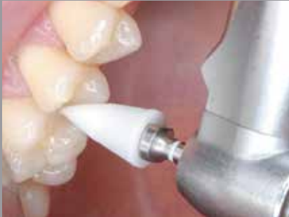
Removes cement or composite flash Removes intrinsic stain