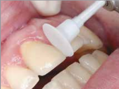
Does not crumble Disposable or reusable shank