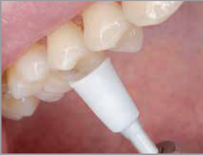
Finish and polish in one step Does not scratch enamel