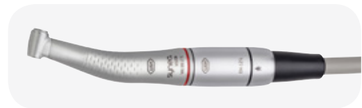
ISO Short WK-93 LTS + EM-12 L + VE-10