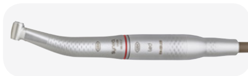
ISO Standard WK-93 LT + EM-E8 LED + VE-9