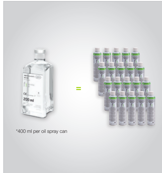
*400 ml per oil spray can

Thanks to the smart process monitoring, the Assistina Twin always achieves thorough maintenance with minimum consumption. The Assistina Twin Care Set only needs to be changed after around 2,800 instruments. Your instrument maintenance is thus not just quick and reliable, but also more cost-efficient than ever.